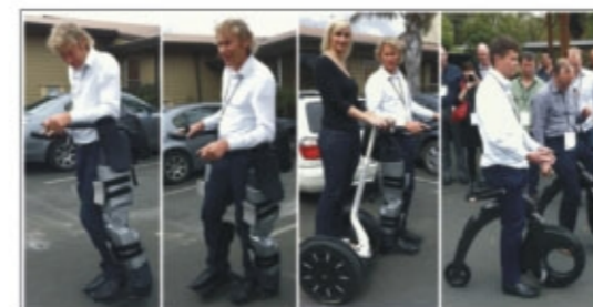
REX BIONICS (Robotic Legs)